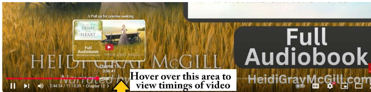
Desire of My Heart Full Christian Historical Fiction Novel Audiobook - Discerning God's Best Series

The ‘video progress bar’ can be found at the bottom of any YouTube video. This will help you navigate the timings of your video including other chapters; rewinding and fast-forwarding.